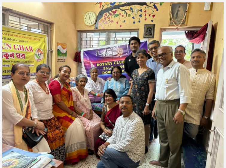
At Natun Ghar –Independence Day celebration and grocery supply – 15 th Aug'25